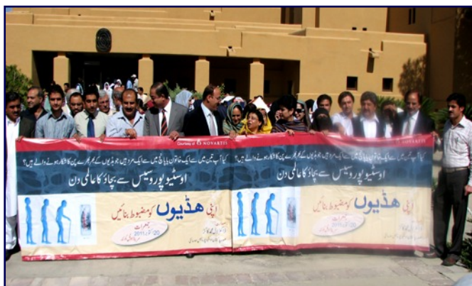
Walk on the eve of World Osteoporosis Day