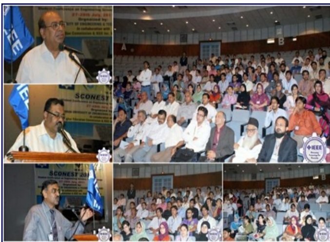
SCONEST conference in progress

SCONEST invited research papers from university students, in order to introduce new scientists and engineers.