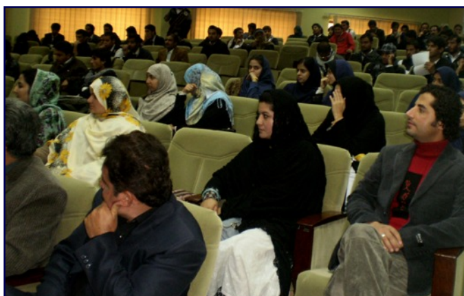
Participants at the symposium.