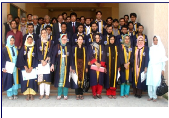
Group of new faculty members with Vice Chancellor

The Directorate of Human Resource Development organized a two week Professional Training Program from September 15 to October 05, 2011 for newly appointed Faculty Teaching Staff in the Training Hall, Takatu Campus. The training was attended by 64 teaching staff from the Faculty of Engineering, Faculty of Information & Communication Technology, Faculty of Management Sciences, Faculty of Life Sciences & Informatics and Faculty of Arts & Basic Sciences, BUIITEMS.