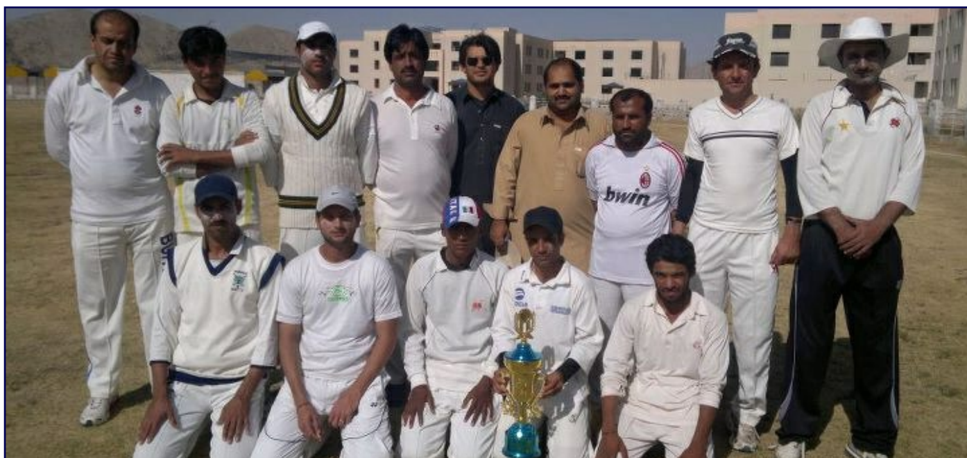
BUIITEMS Administration Team, Takatu Campus with Trophy