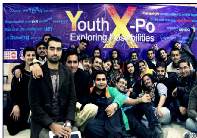
A group photo of the Youth X-Po

Youth X-Po was particularly fruitful for the youth of Balochistan as they gained new knowledge, learned energetic activities and partook of world-class facilities at BUIITEMS.