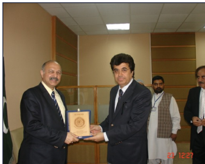
Vice Chancellor BUIITEMS presenting University shield to Mr. Mushahid Hussain Syed

The University shield was presented to Mr. Mushahid Hussain as a memento of his visit to BUIITEMS.