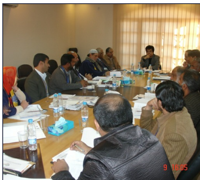
Vice Chancellor addressing the Board Meeting