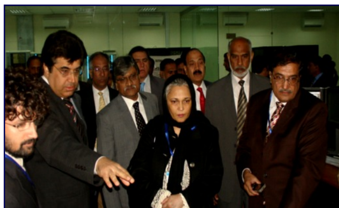
Visiting Trainee officers being show CMS

On their visit to the Takatu Campus, the group was shown various laboratories and academic facilities, CMS and Data Center, Libraries, Seminar Halls and the Expo Center.