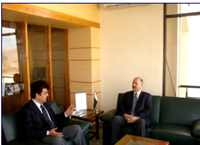
Mr. Mushahid Hussain Syed with Vice Chancellor