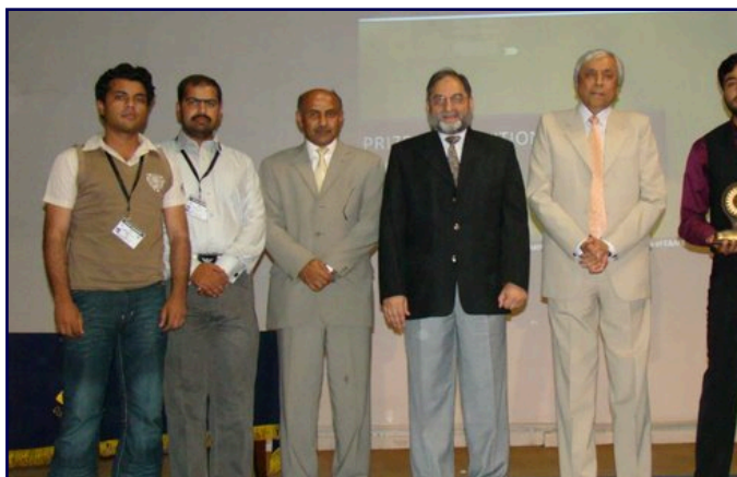
BUIITEMS students with the Chief Guest

An unmanned programmed vehicle capable of loading blocks and moving them to the desired slot shown in the arena marked as a colored slot was presented under the project 'QZZZ'. It was capable of performing the assigned task repeatedly. The color and white line follower sensors were also installed to guide the robot to find the path in case some hurdles propped up in its normal path.