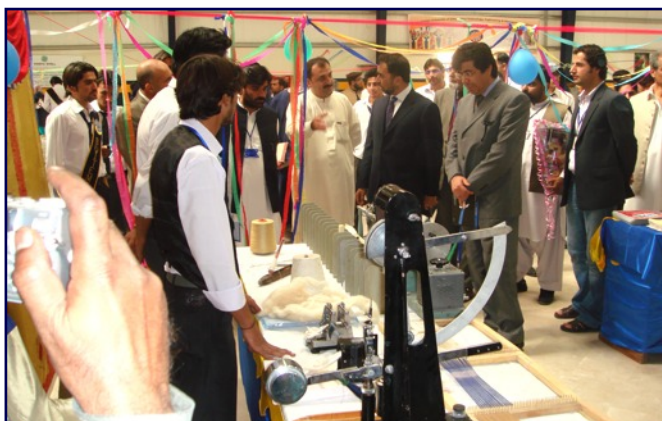
Vice Chancellor and Member SUPARCO going round the stalls

BUIITEMS and SUPARCO organized the “World Space Week” event from October 10-11, 2011 at Takatu Campus, BUIITEMS. The objective of the event was to create awareness among the students regarding space applications and space studies being carried out in Pakistan.