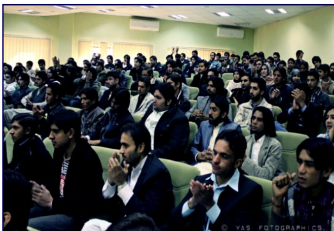
Dua being offered at Youth X-Po

Around 200 youth from different universities and colleges participated in the event and mentors from different organizations shared their views and knowledge with the group.