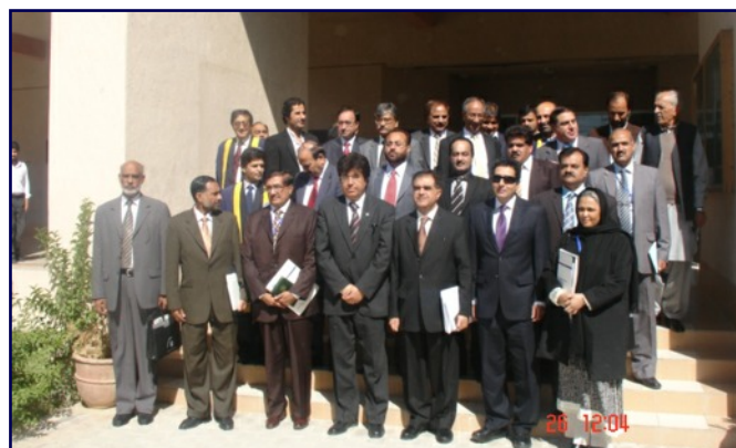
Senior Management group with Vice Chancellor