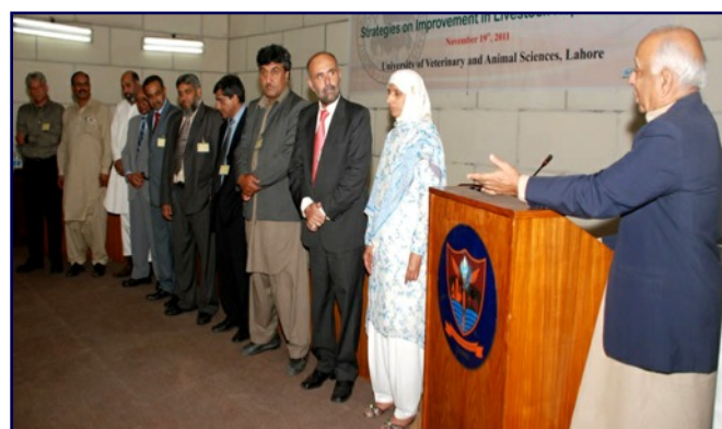
Participants of the National Workshop