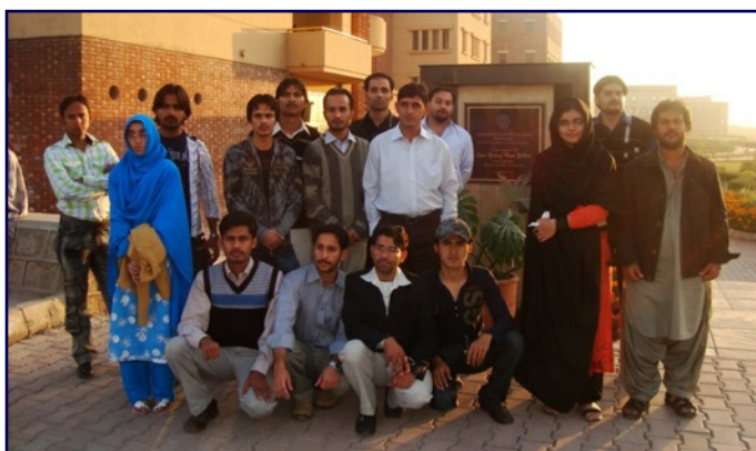
Group photo of students of BUIITEMS