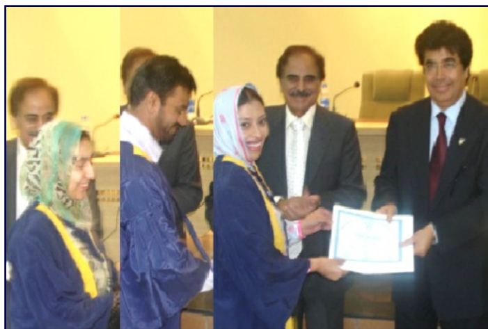
Trainers receiving certificates from Vice Chancellor

Vice Chancellor, in his address to the teachers, advised them to participate actively, taking full advantage of the opportunity. He stated that many other training programs would also be conducted. He hoped that the training would equip them with professional teaching techniques.