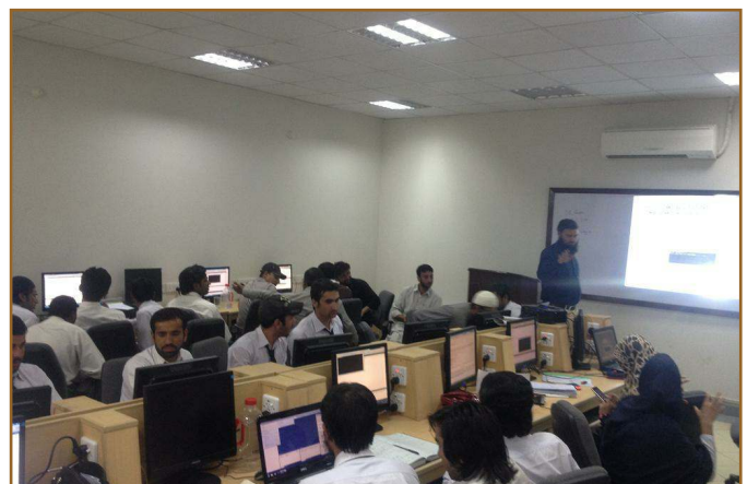
Training Course in progress

A five day training program under the scheme Continuous Professional Development (CPD) was organized by Directorate of Human Resource Development (HRD) from June 07-11, 2012 at Takatu Campus, BUIITEMS. 40 participants including 25 students and 15 faculty members from the departments of Computer Science, Computer Engineering and Information Technology participated in the training.