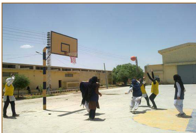
Basketball match in progress

The final match of the tournament was played between City campus vs Takatu Campus. City Campus won the tournament beating by 14-04.