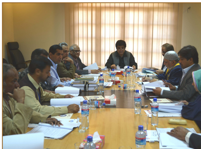
Meeting of the Academic Council in progress

made, and some were referred to the Syndicate for its consideration.