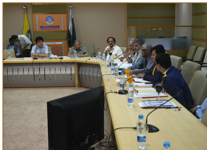
Meeting of the BUIITEMS syndicate in progress

BUIITEMS Syndicate welcomed the learned members of the syndicate. Agenda items were presented before the house for deliberations and decisions were made accordingly. The meeting ended with a vote of thanks for the chair.