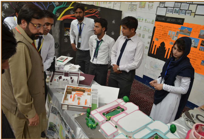
The chief guest examining Architecture Models