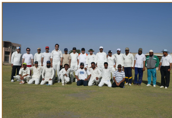
Group photograph of Admin & Faculty Teams

The final match in the category was played between Administration of the City Campus and Faculty of the City Campus. Administration team won the tournament, beating Faculty by 3 wickets.