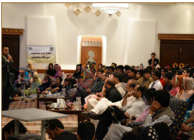
A section of participants in Quetta Youth Conference

Organization for the Development of Youth (ODY) organized a Two day "Quetta Youth Conference" under the theme of "Mera Pegham Muhabbat Hai". More than 250 Students from different institutions participated in the conference.