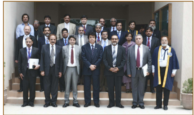
Group photograph of SMC participants with VC and senior officers of BUITEMS.