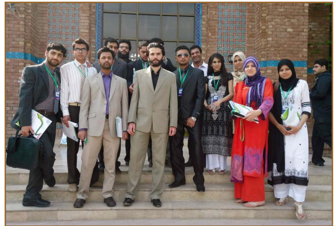
Group photograph of BUIITEMS participants of FAST NU Competition

The president said in his speech that it was the first time that any team from Balochistan had joined the competition and performed so well.