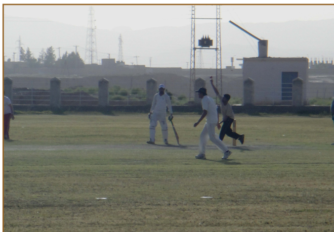
Cricket match in progress

Interdepartmental Cricket matches were played from 14th May to 5th of June 2012. Thirty two departments participated in the event. The departments were divided into two groups. Matches were played on the basis of knock out system.