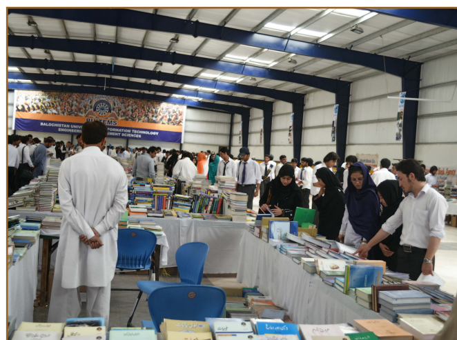
A composite view of the National Book Fair