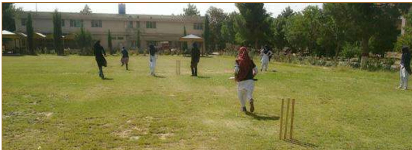
Cricket match between girls' teams in progress