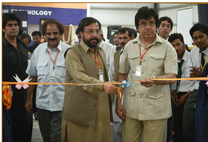
Engr. Zamrak Khan inaugurating the exhibition

Provincial Minister Engr. Zamrak Khan inaugurated the exhibition. In his inaugural address, he appreciated the projects made by the students, and announced a donation of Rs: 100,000/- for the Department and also assured the University authorities of his support in nation building programs.