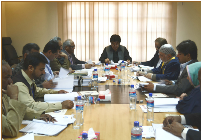
AS&R Board meeting in progress

scholars. Agenda items related to graduate programs of studies, research proposals, research supervisors, external examiners and related matters were deliberated upon in detail and recommendations were made.