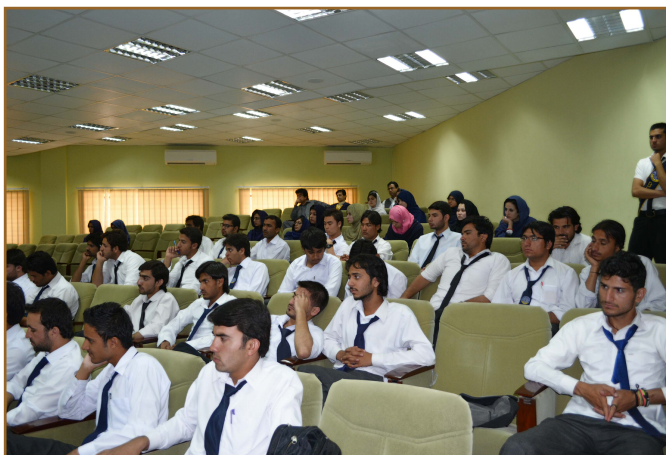
A section of the Workshop participants.

participants. Students of final semester from all the faculties of BUITEMS participated in these workshops.