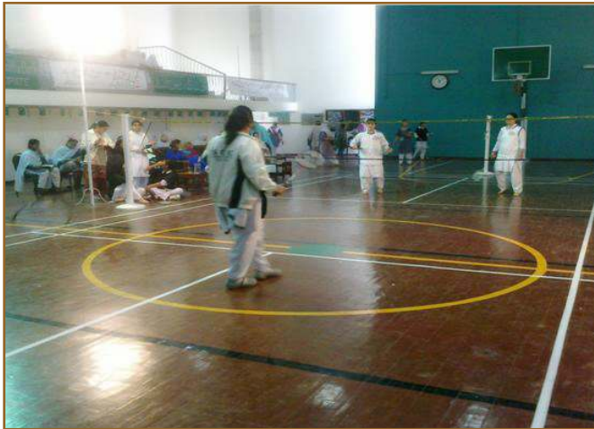
Badminton match in progress