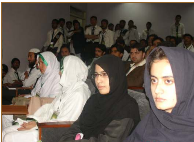
A section of the workshop participants