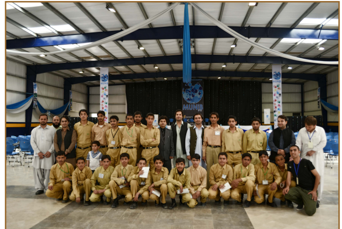
TCF School students group in Expo Center

The visiting students were taken on a round to different laboratories and departments of the university.