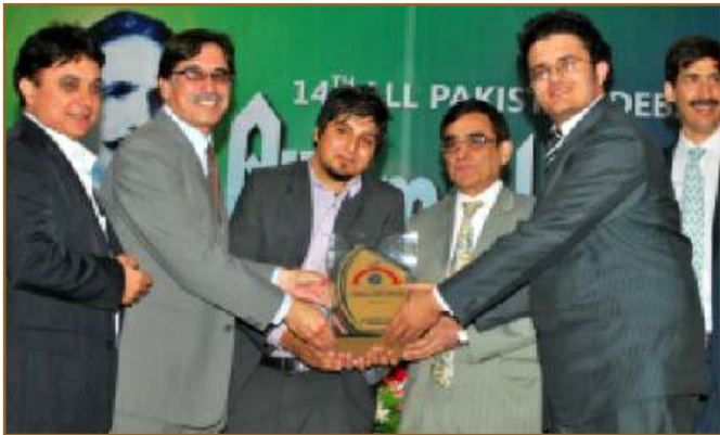
Chairman HEC awarding shield to participants

Allama Iqbal Shield Extempore Debate Contest is held every year under the aegis of the Higher Education Commission in collaboration with the Ministry of Education. This year the contest was held on 12 th April 2012, in HEC Auditorium Islamabad. A total of 30 student debaters from all the provinces of Pakistan participated in the bilingual extempore debate.