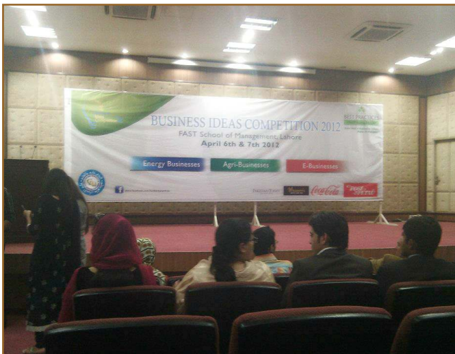
Business Plan Competition in progress

At the end of the seminar a question answer session was conducted. The honorable Vice Chancellor, in his concluding remarks stressed the need of HEC support for initiatives taken by BUIITEMS.