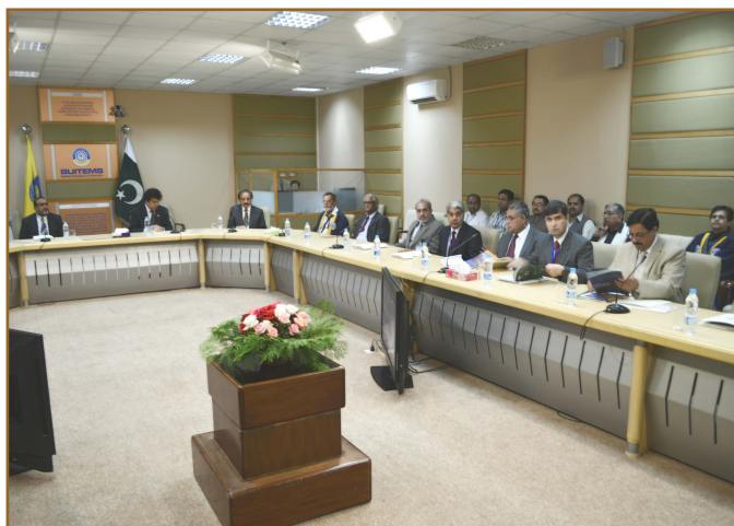
11th SMC participants being briefed by the Vice Chancellor