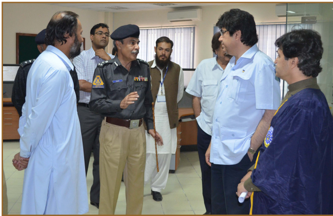
CCPO is being briefed about the CMS