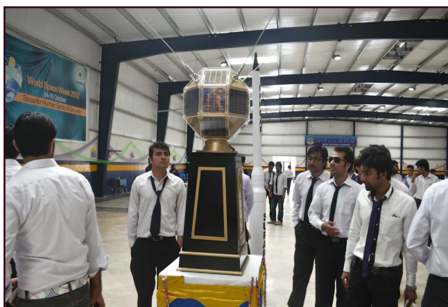
Students observing a model