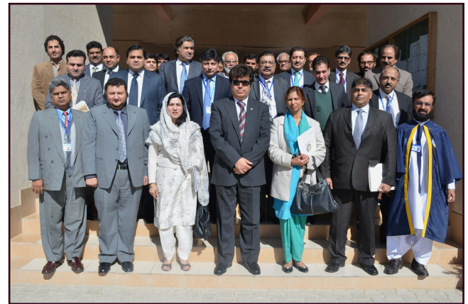
Group photograph of SMC participants with VC