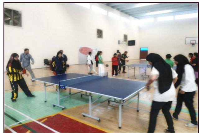
BUITEMS Table Tennis Team in action

All Pakistan Inter-varsity (Women) Championship was held under the auspices of HEC at the DOW University of Health Sciences, Karachi from 1st to 9th of December 2012. Eleven teams from different universities / Institutions participated in the Tournament.