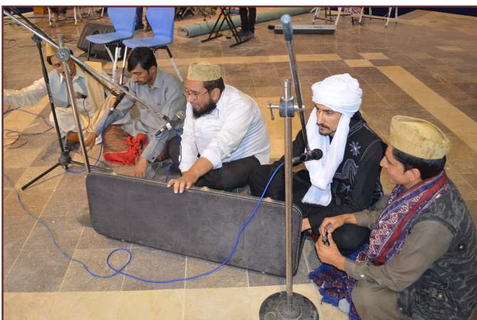
A group of students performing in the event