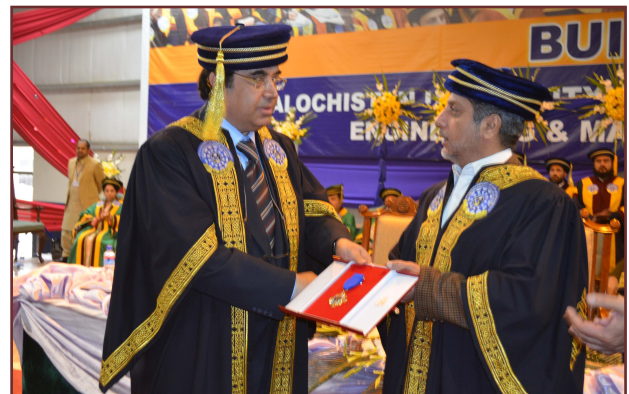
Vice Chancellor, receiving the SOCRATES award from Chancellor, BUITEMS

several levels of its excellence and set an example of being a role model and Exemplary Leadership. Individuals behind the institution who are building their institutions through Leadership, Innovation, Academic and Industry Interface.