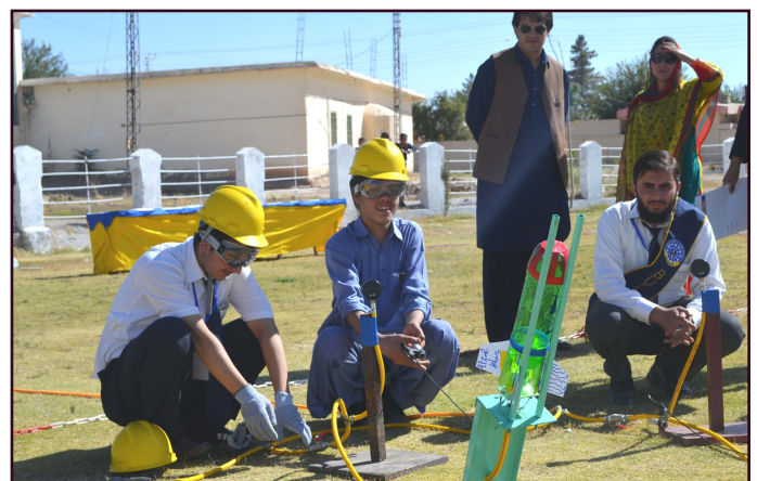
A demonstration of rocket models