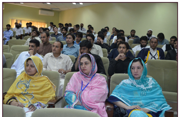
A section of audience in the program

ETABS was discussed to introduce modeling, defining and assigning material & sectional properties. Different load cases and their applications were also discussed. In the concluding session, Design and Analysis options and procedures to get final results of a concrete building design were discussed. Registrar, Pakistan Engineering Council distributed certificates among the participants and appreciated the efforts of BUITEMS.