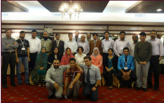
A group photograph of AIT Master Trainers