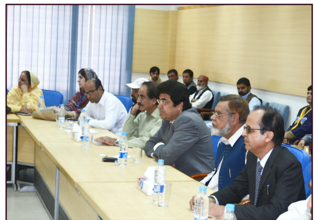
Vice Chancellor briefing the delegation