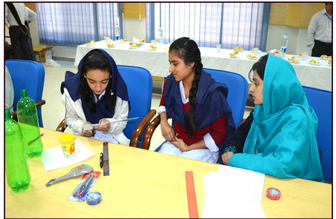
Students preparing themselves for rocket competition

of Quetta city participated. Various activities including Water Rocket Competition, Declamation Contest, Quiz Competition and Astronomy Night were held on the occasion.