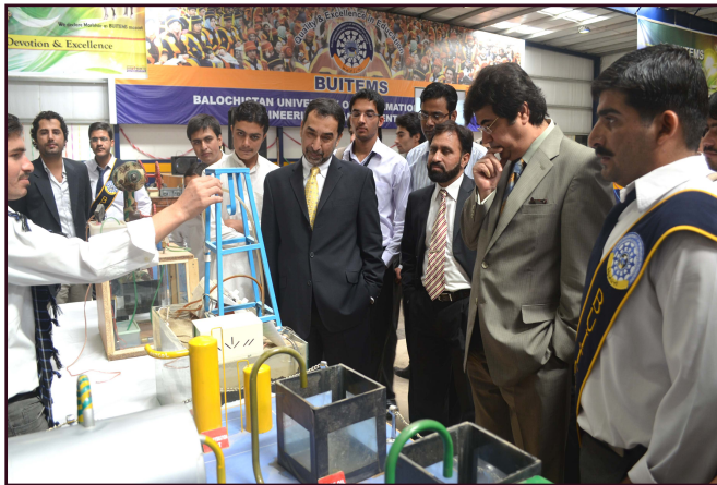
Vice chancellor visiting a stall

The organizers responded to the questions of the students regarding the progress in science and technology especially about space.