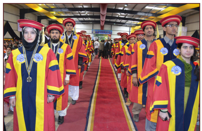
Recipients of Gold Medals and Badges of Honor