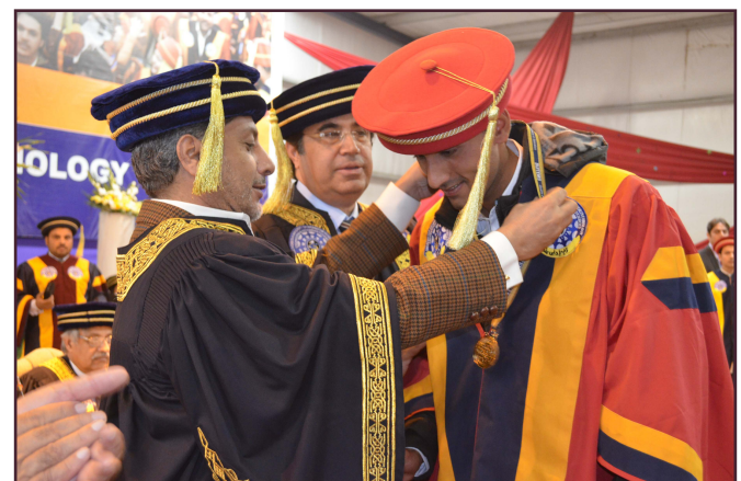
A graduate receiving Gold Medal