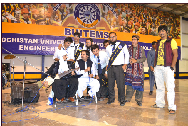
Students presenting dramas at the decade celebration

The event commenced with recitation of verses from the Holy Quran and Na'at.