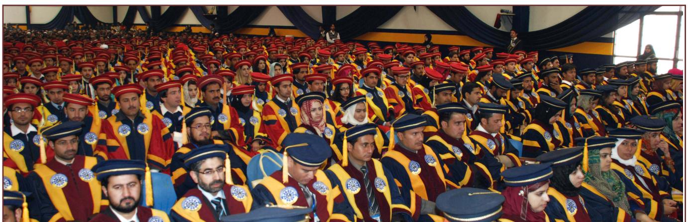
Section of Faculty and graduating Students at the Convocation