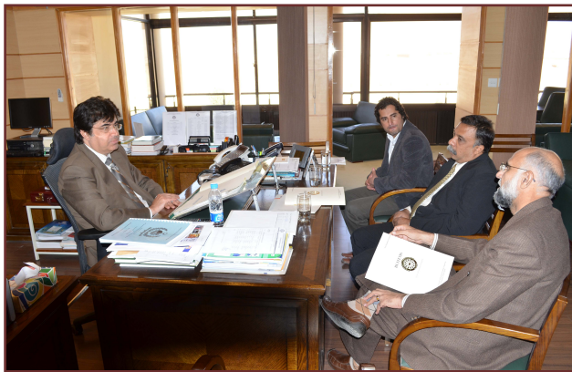
Director PIM with the Vice Chancellor

practices in public/private organization in Balochistan. The first training program under the MoU will be conducted in March 2013.