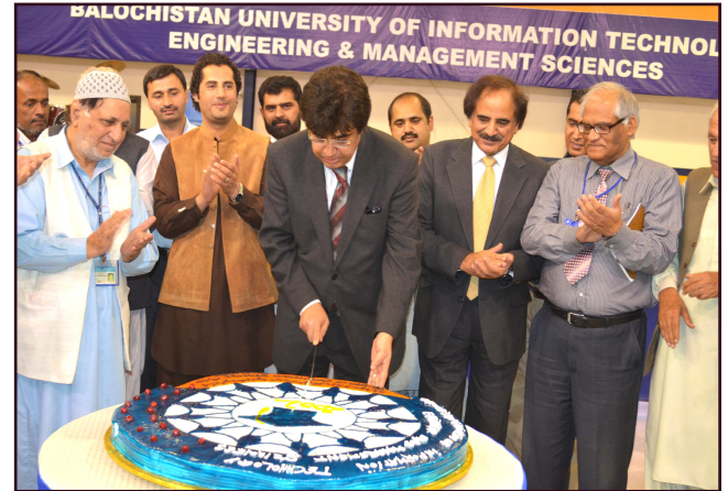
Vice Chancellor cutting the Cake