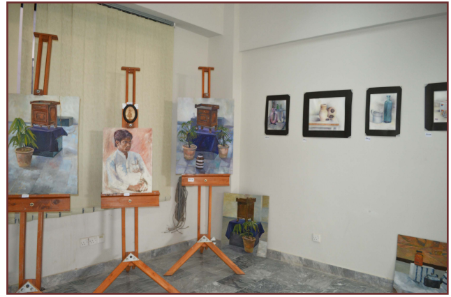
Glimpses from Face-Off Exhibition

'Face Off' is an Artists' Camp of dedicated individuals aiming to discuss, understand and reflect upon the phenomenon of Terror and its consequences. The Artists' Camp was organized jointly by Hunerkada, Quetta and Directorate of Culture, Government of KPK Pashtoonkhwa, at BUITEMS from 27th to 30th November, 2012. Theme of the camp was: "Terrorism and its Consequences." Students of Fine Arts from BUITEMS, UoB and SBKWU took part in the camp. The exhibition was inaugurated by the Vice Chancellor Ahmed Farooq Bazai. He was deeply impressed by the works of art that brought back so many dark memories of sad incidents that had taken place in the city. The Vice Chancellor encouraged the students to take part in activities aimed at restoring hope and emphasized on creating awareness about the importance of peace amongst communities. Teachers and students appreciated the exhibits which were displayed. The camp brought together renowned artists from various fields to share their understanding of the subject and to explore newer means of expression for initiating a dialogue for peace in society.