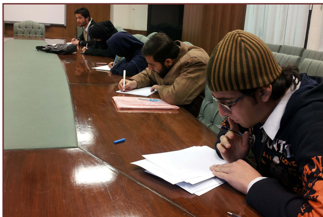
Students during essay writing competition