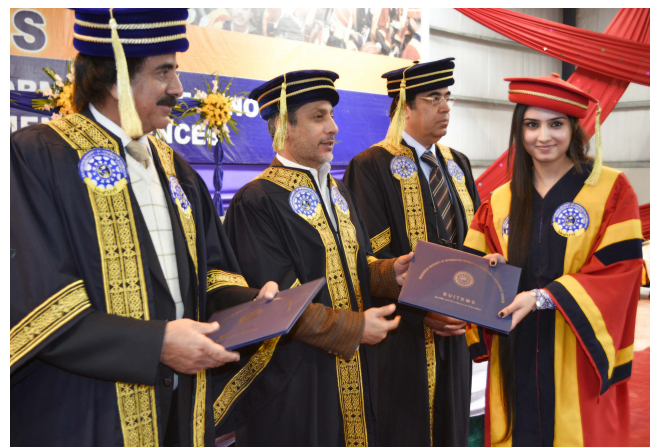
Degree being awarded to a graduate

After the welcome address, degrees were awarded to graduating students in the fields of Computer Engineering, Computer Science, Textile Engineering, Electronic Engineering, Telecommunication Engineering, Biotechnology & Informatics, Environmental Management and Policy, Business Administration, and Arts and Basic sciences.