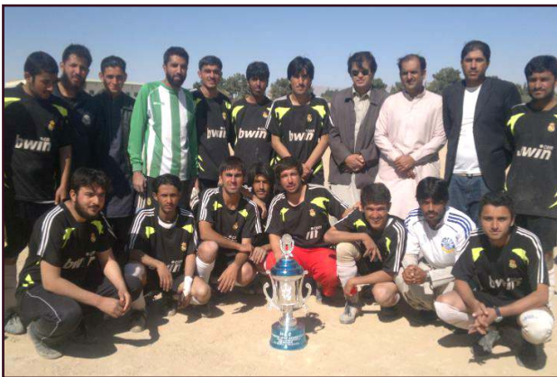
Winners of All Pakistan Inter-varsity Football championship