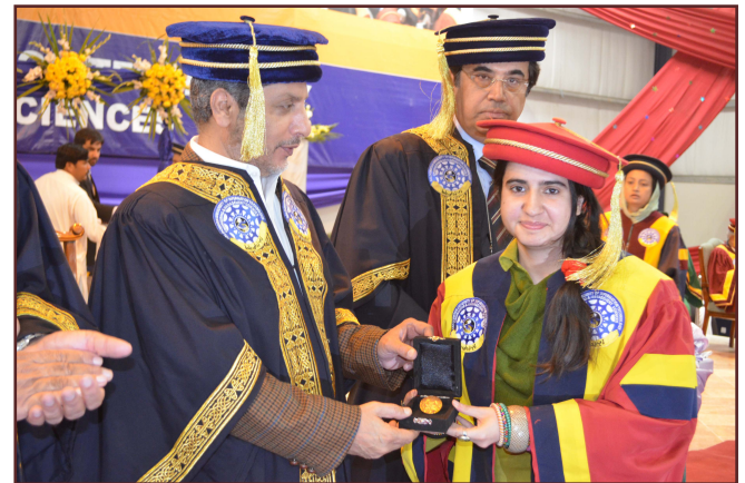
Badge of Honor is being received by a graduate