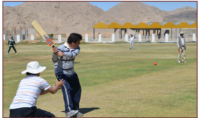
Vice Chancellor dispatching the ball to the boundary

Two cricket matches were played on 6 th of October, 2012 as part of BUITEMS 1st Decade Celebrations. The first match was between the Administration and Faculty.