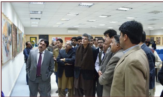
Gathering of art lovers at Exhibition