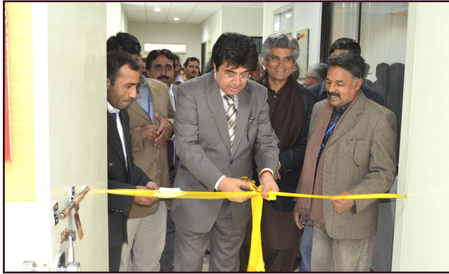
Vice Chancellor Inaugurating the Art Exhibition

The Department of Fine Arts contributed to the 10 th Anniversary celebrations of BUITEMS by holding an exhibition showcasing the work of BUITEMS talented students.